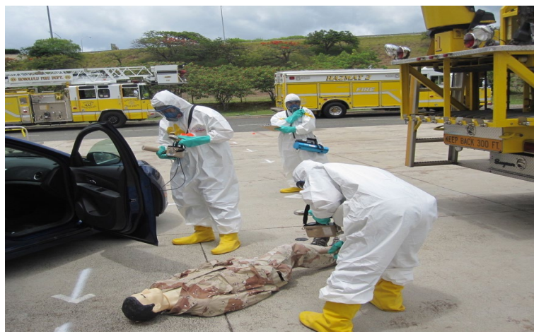
Participants performing surveys during an exercise.